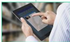
Tablet (iOS / Android)