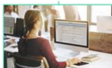
Modern web browser (Chrome, Edge etc)