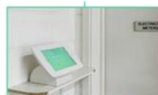
Kiosk mode (beta)