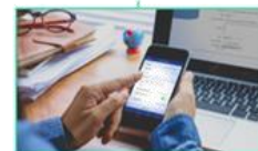
Smartphone (iOS / Android)